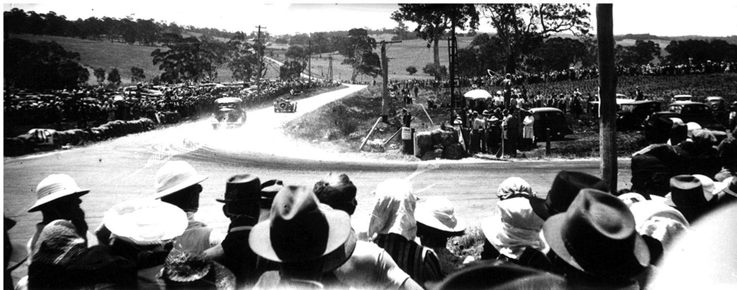
The 'Lobethal crowd taking in the championship race in 1939. The S.S.100 (#18044) in front of a Hudson 4.1 litre V8.

Information for this story from Web Blog PRIMOTIPO