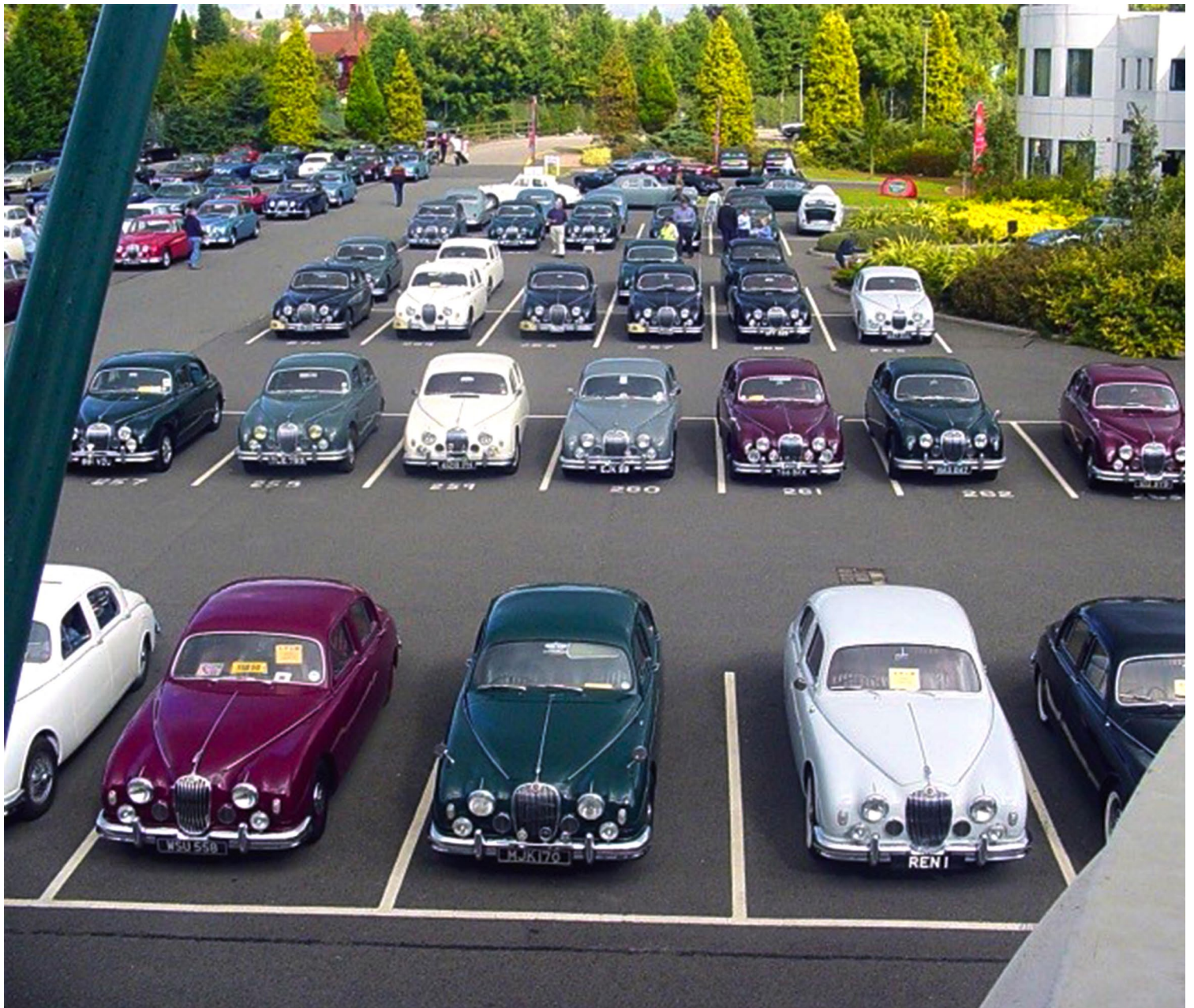
On my visit in 2005 to Browns Lane, JDHT were celebrating the 50th Anniversary of the Mark I. Many Jaguar models also attended.