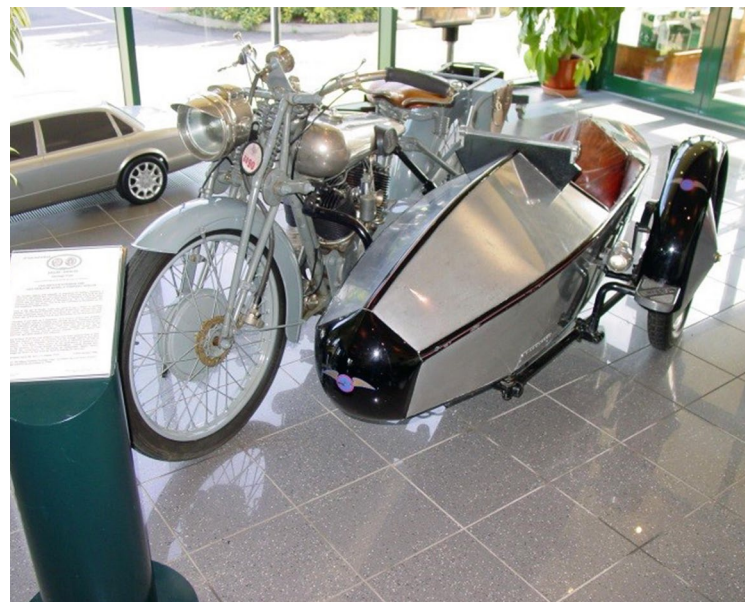
The JDHT collection includes displays dating back to the 1920's &30's. Above left: "SS Airline" and above right: "Swallow Sidecar".