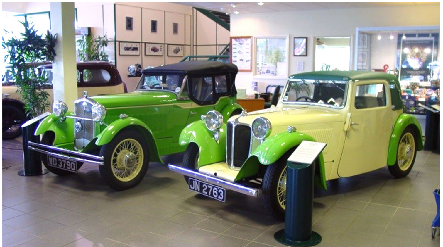
The JDHT collection includes vehicles dating back to the early days of the Swallow Sidecar and Coachbuilding Company.