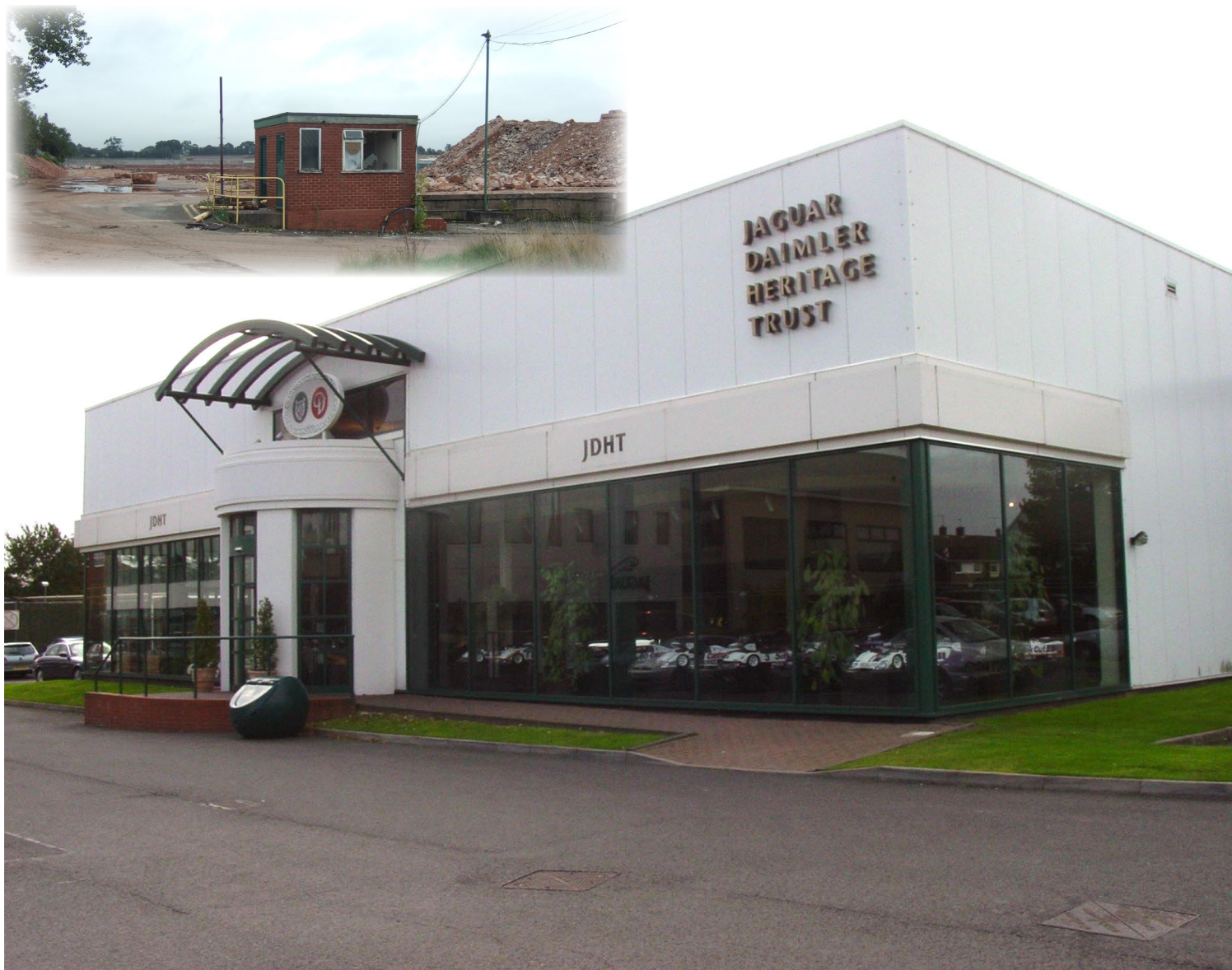
Browns Lane was sold in 2007 and the buildings progressively demolished including the building above. The museum was then moved to two permanent displays in Gaydon and Coventry. The majority of the site was turned into a housing estate known as "Swallow's Nest".