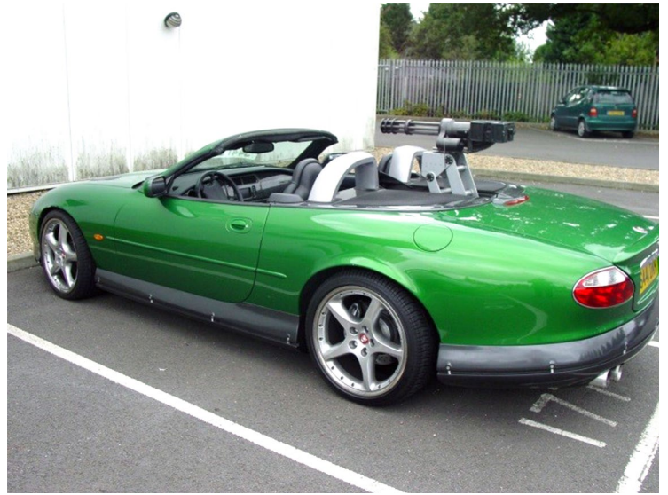
The collection included former Jaguar race cars and specialist vehicles like the Jaguar XKR used in the James Bond film "Die Another Day".