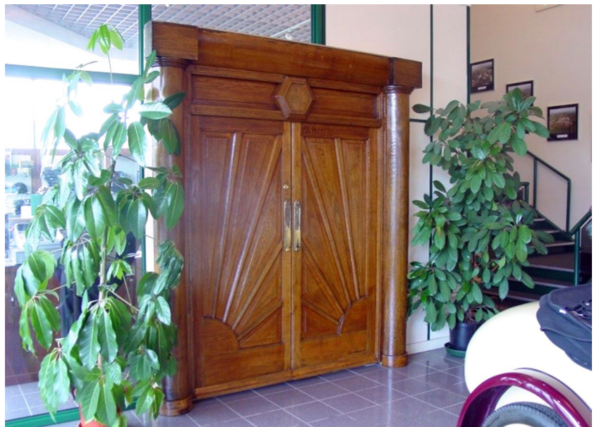
Photo left: 1939 Jaguar Saloon parked at the SS's front doors. The plaques by the doors denote the registered offices of the Swallow Coachbuilding Company and SS Cars Ltd. Photo above: The original doors on display at JDHT.