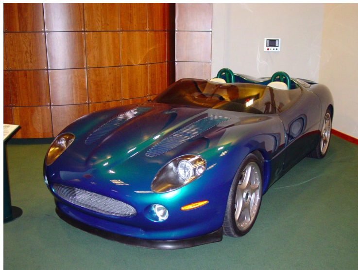
One car which attracted a lot of interest was the XK 180 Concept car. Built in 1999 to celebrate the 50th anniversary of the XK 120. The 4.0 litre supercharged V8 had a claimed top speed of 180 mph. Only two XK 180 roadsters were built, one LHD and the other RHD.