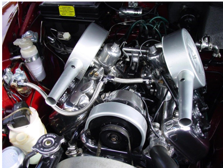
The famous Daimler V-8 engine that was designed by Edward Turner and produced from 1959 to 1969.