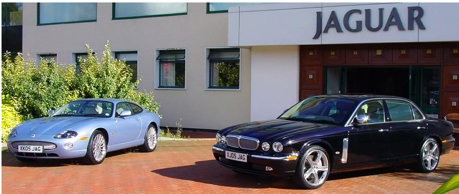
Displayed proudly outside of the entrance was the last ever vehicle to be manufactured at the Browns Lane factory, a magnificent XJ; and also the last ever XK8 vehicle to be manufactured at the facility.