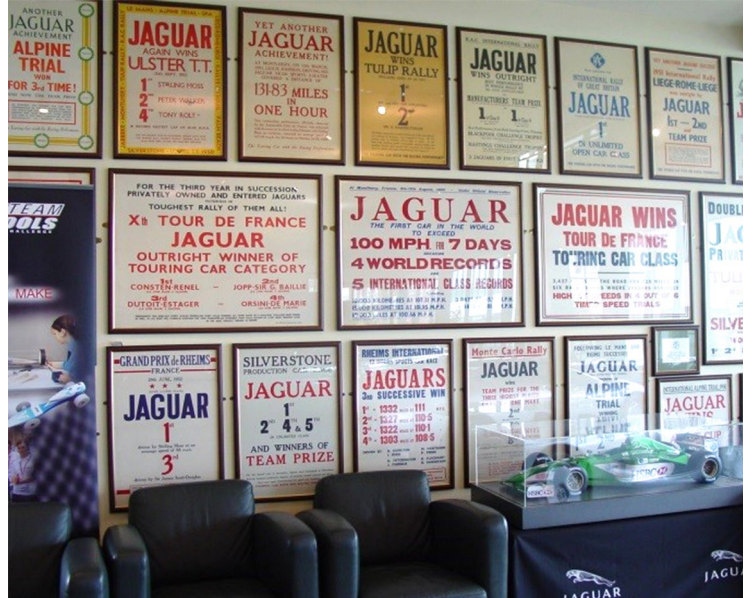
The Collection was more than just vehicles, and included a range of posters, sectioned engines, parts and a range of memorabilia.