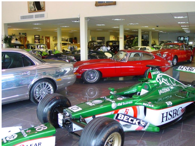
The collection includes a huge selection including a Jaguar F1 car and a polished aluminium XJ.