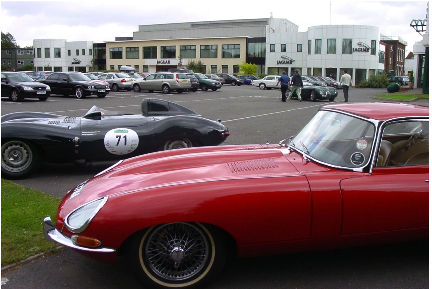
At the time of my visit a number of vehicles were displayed outside the Jaguar HQ Building, Offices and Heritage building. In the above photo you can just see the curved verandah to the entrance of the old Browns Lane JDHT building on the far right hand side. (Now all demolished).