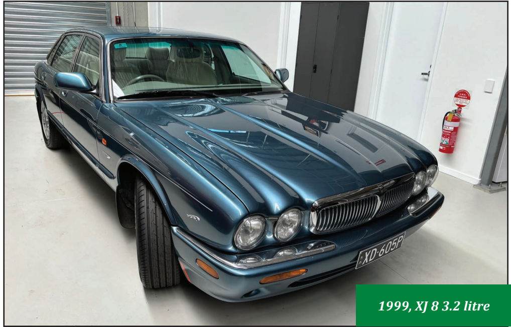
1999, XJ 8 3.2 litre