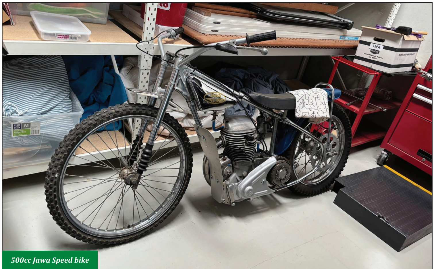
500cc Jawa Speed bike