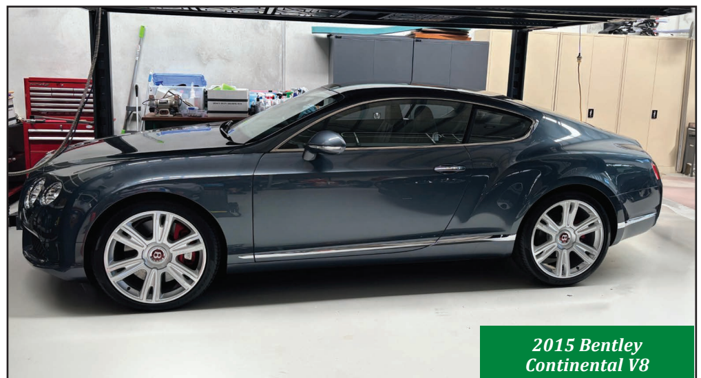
2015 Bentley Continental V8