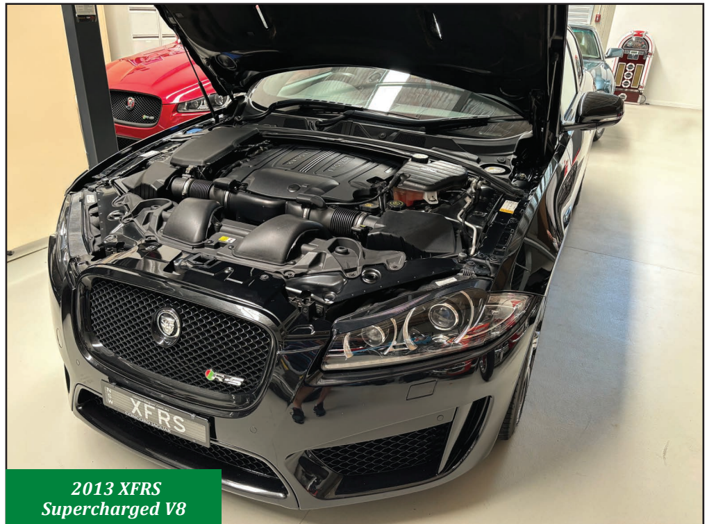
2013 XFRS Supercharged V8