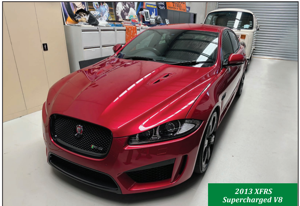
2013 XFRS Supercharged V8

I opened a tyre store on Tapleys Hill Road, Seaton with $7,200 having