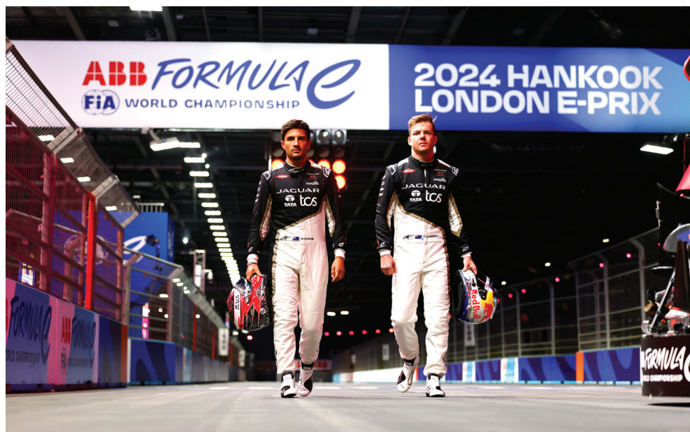
New Zealander drivers Mitch Evans and Nick Cassidy were both unlucky not to win the Drivers Championship, finishing 2nd & 3rd and within a few points of Pascal Wehrlein (Porsche).

By the 33rd lap, Evans, having secured his final Attack Mode after a technical glitch, found himself in third behind Rowland and Wehrlein. These positions remained unchanged until the checkered flag, solidifying the Teams' Championship win but leaving a bittersweet taste for the Drivers' title.