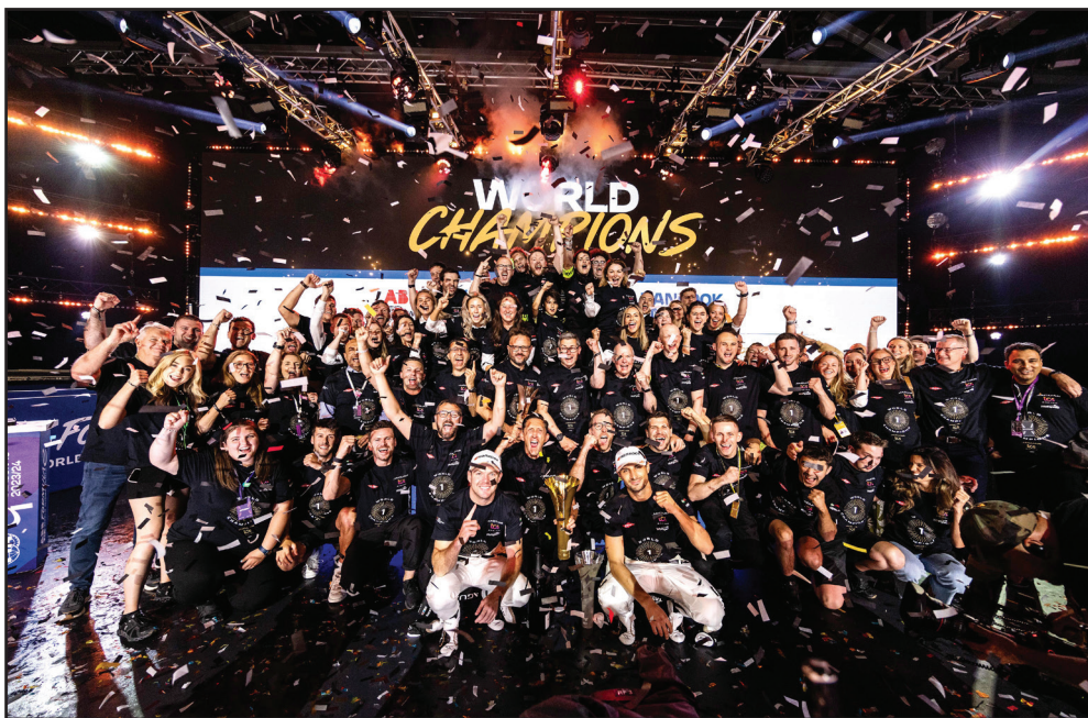
Jaguar have won both the 2024 Formula E Teams' and Manufacturers World Championship