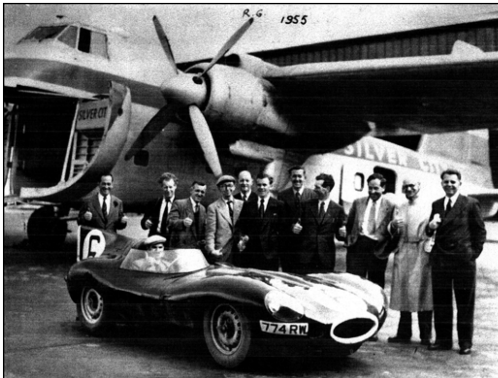
1955 winning 'D' type Jaguar returning from Le-Mans. Taken at Elmdon airport/Birmingham with mechanics and technical staff.