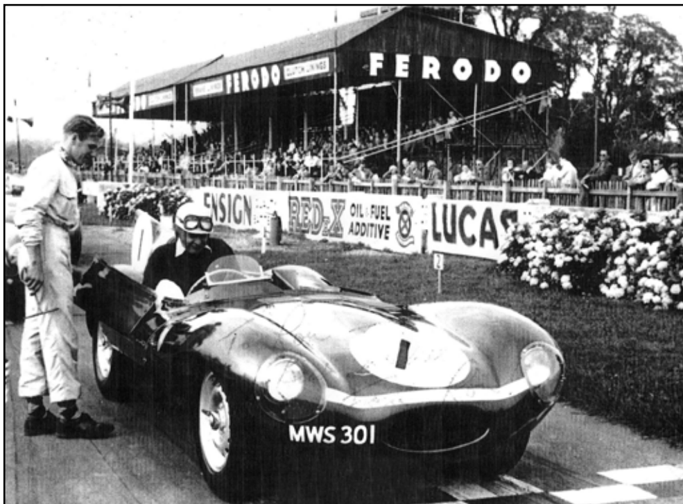
1956 B.A.R.C. National Meeting Goodwood, Saturday 8th September - Ron Flockhart

Ron was a mechanical engineer, drove an Austin Healy, and was a test driver for BRM, he also flew a WW11 Mustang, a